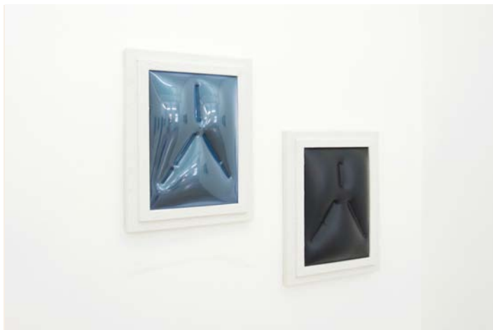
- ARTWORK BBOBBLG0811 + BOGOBBLG0512