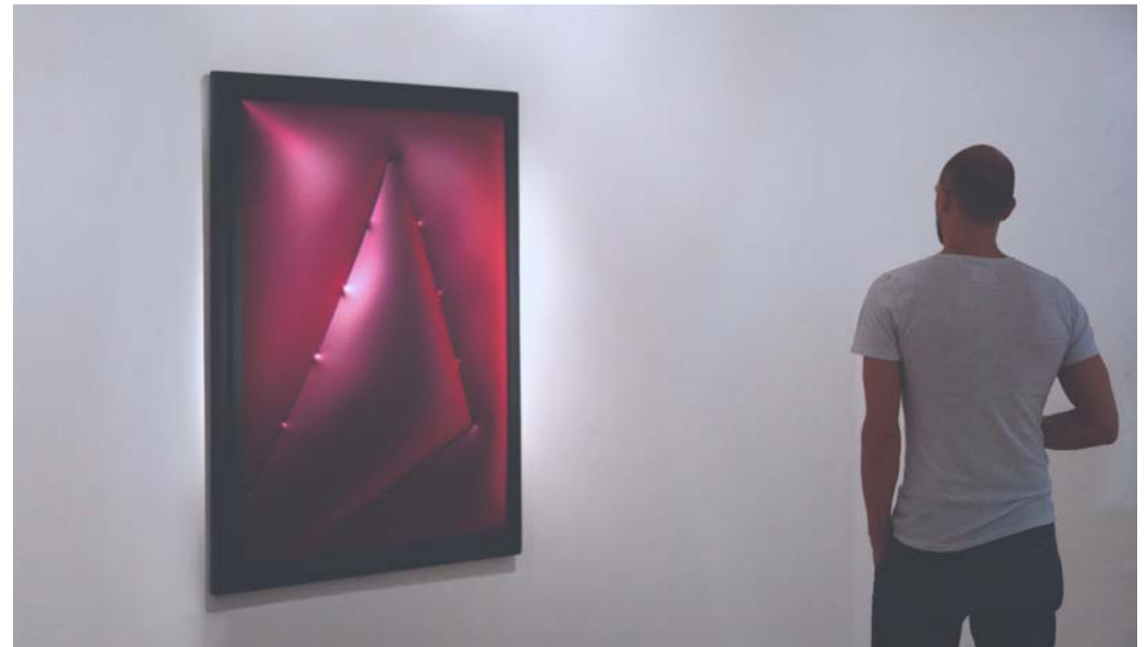
- ARTWORK MBOBBL0801

The Pressure Forming, as increasing Surface Bulge outward, is in correlation with the maximum inner Pressure! The volume is the quantity of three-dimensional spatial contents of the vinyl body. The possibility of a comparison with the form and space underscoring that one of the characteristics and formal conception of using Air as a tool consists of an expansion of elastic material that breathes on the surface and ventures on a light rambling without any apparent regularity, that reveal an affinity on the surface with Air. The lines that follow one another bring to mind the variation on a theme evokes, intentionally, the high relief of composition by virtue of its shade and rhythm.