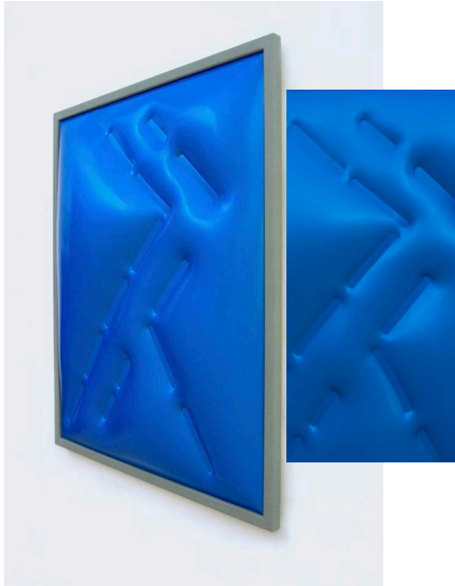
- ARTWORK GL1702