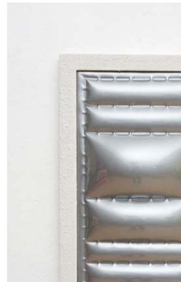
- ARTWORK CSBL1611