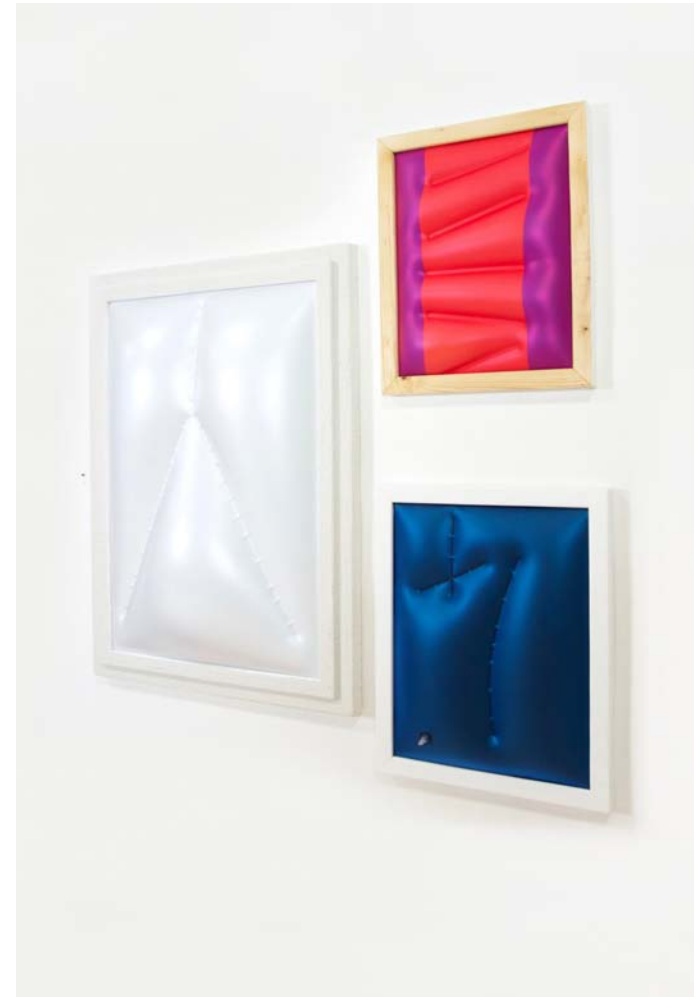
- ARTWORK WBBBL0108 + BTBTBBBL0111 + MGBBL2003