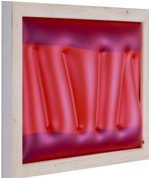
- ARTWORK MGBBL2003

The Pressure Forming, as increasing Surface Bulge outward, is in correlation with the maximum inner Pressure! The volume is the quantity of three-dimensional spatial contents of the vinyl body. The possibility of a comparison with the form and space underscoring that one of the characteristics and formal conception of using Air as a tool consists of an expansion of elastic material that breathes on the surface and ventures on a light rambling without any apparent regularity, that reveal an affinity on the surface with Air. The lines that follow one another bring to mind the variation on a theme evokes, intentionally, the high relief of composition by virtue of its shade and rhythm.