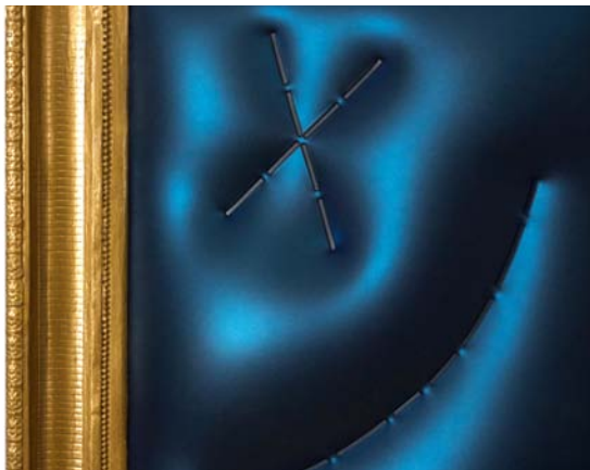
- ARTWORK BTBTBLO0908

Multiple layers of different colors with contemplation color opaque and translucent vinyl- film and, among other things, like coloring with ink or acryl, as well grinding are a possibility to extend the bulge- out surface from the air supported structure, based in a contemporary artistic way.