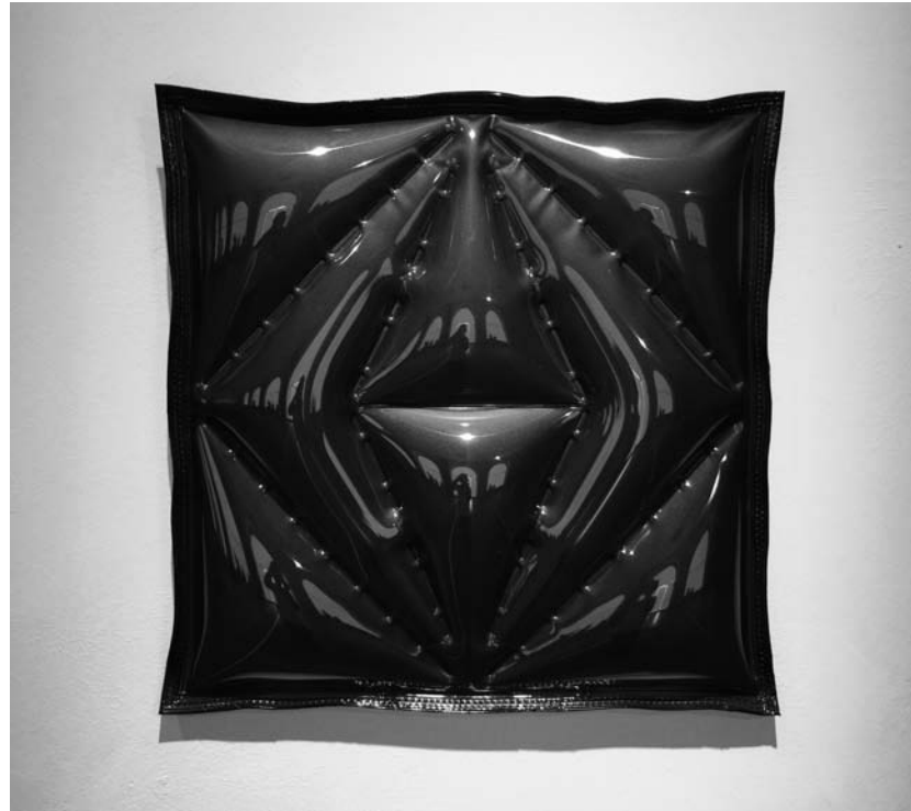
- ARTWORK COBLBBL1305