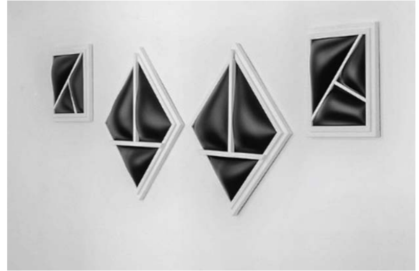
- ARTWORK BL2105 - Serie BLACK-LINE