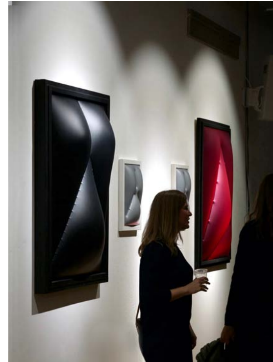
2018 - SPLICE GALLERY

( Luigi Fontana, Manifesto Blanco 1946 )