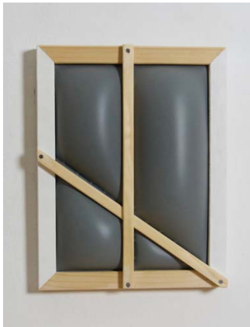
- ARTWORK GOBBL1308

My inspiration for this was simple. I wanted to create a modern, minimalistic abstract wall sculpture, inflatable with acoustic characteristics. Not always an easy task, but the soft vinyl turns the acoustic treatment and the complement of a modern contemporary feeling of the art piece successfully. I love creating pieces that offer different and juxtaposing textures (for example, Glossy and Diffuse). In the end I think I achieved my goal of making this inflatable wall sculpture be both elegant and modern.