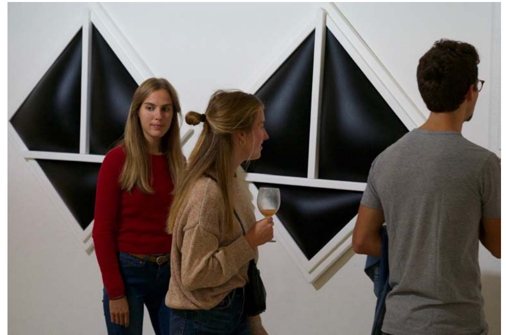
- ARTWORK BL2104 Serie BLACK LINE

My inspiration for this was simple. I wanted to create a modern, minimalistic abstract wall sculpture, inflatable with acoustic characteristics. Not always an easy task, but the soft vinyl turns the acoustic treatment and the complement of a modern contemporary feeling of the art piece successfully. I love creating pieces that offer different and juxtaposing textures (for example, Glossy and Diffuse). In the end I think I achieved my goal of making this inflatable wall sculpture be both elegant and modern.